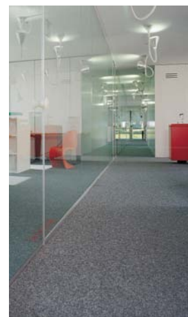
Planet KG-U, application in an office building