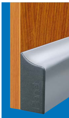
Option: Planet KG-S, laterally pasted on wooden door