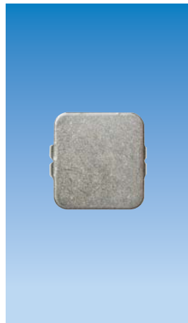
Planet stopping plate, type 1, stainless