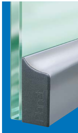
Planet KG-S, with cover plate