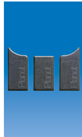
Planet KG, set of cover plates