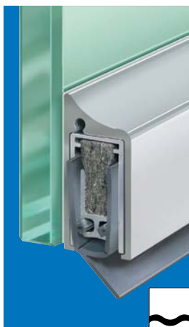
Option: Planet KG-S, bevel lip for wavy floors