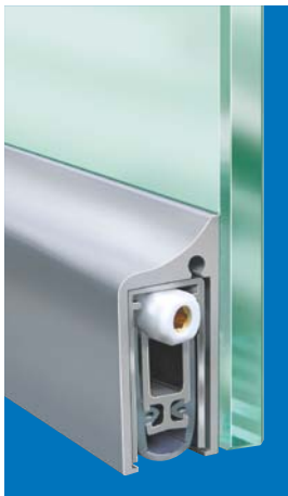
Planet KG-S, pasted laterally on glass door