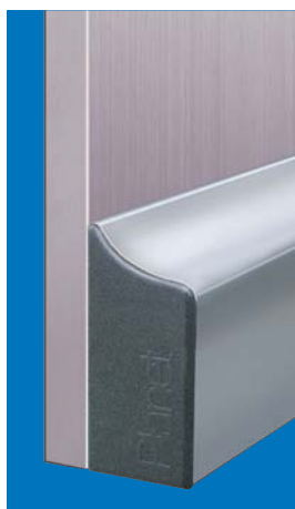
Option: Planet KG-S, laterally pasted on metal door